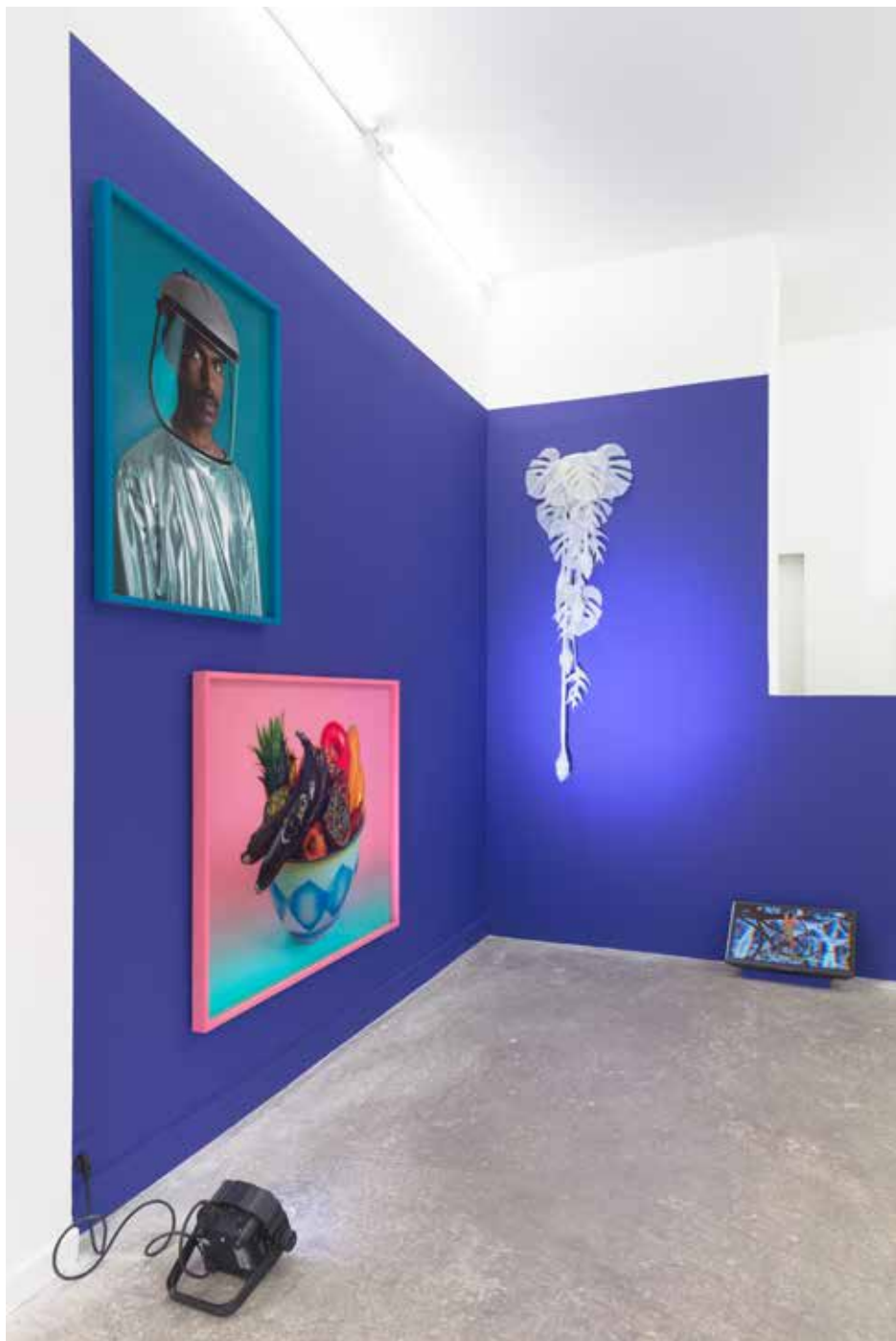
VUE D'EXPOSITION, MY BODY ≠ TA CHOSE EXHIBITION VIEW, MY BODY ≠ TA CHOSE