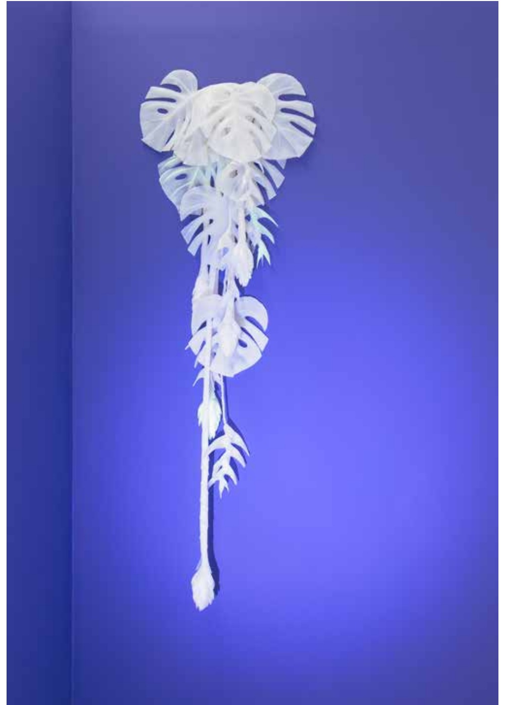
DESI SANTIAGO, ANDROMEDA, SILICONE, 160 H 40 CM, 2019 DESI SANTIAGO, ANDROMEDA, SILICONE, 160 H 40 CM, 2019