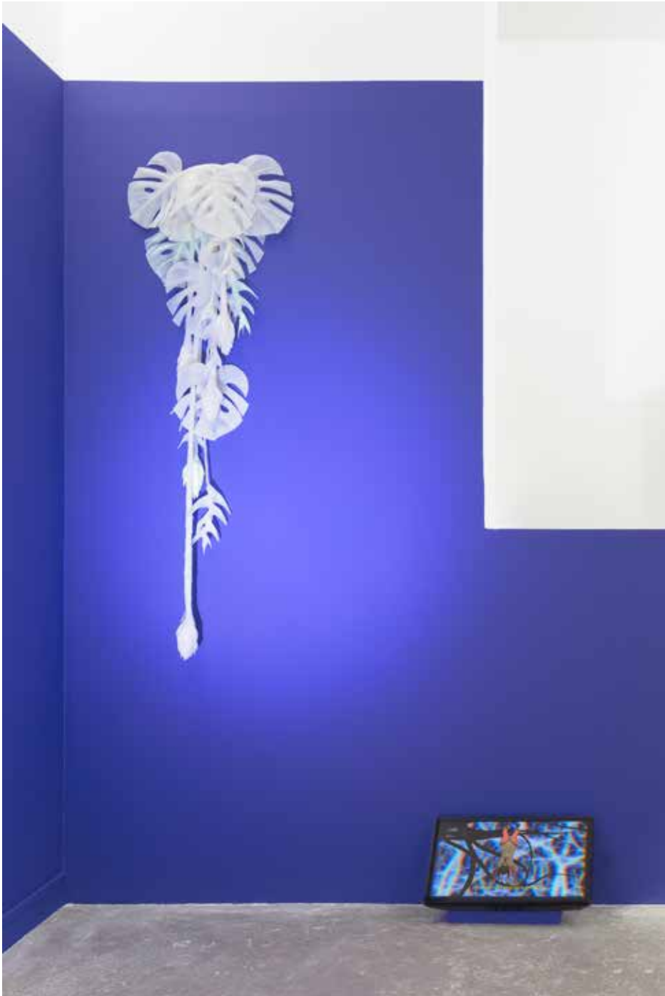
VUE D'EXPOSITION, MY BODY ≠ TA CHOSE EXHIBITION VIEW, MY BODY ≠ TA CHOSE