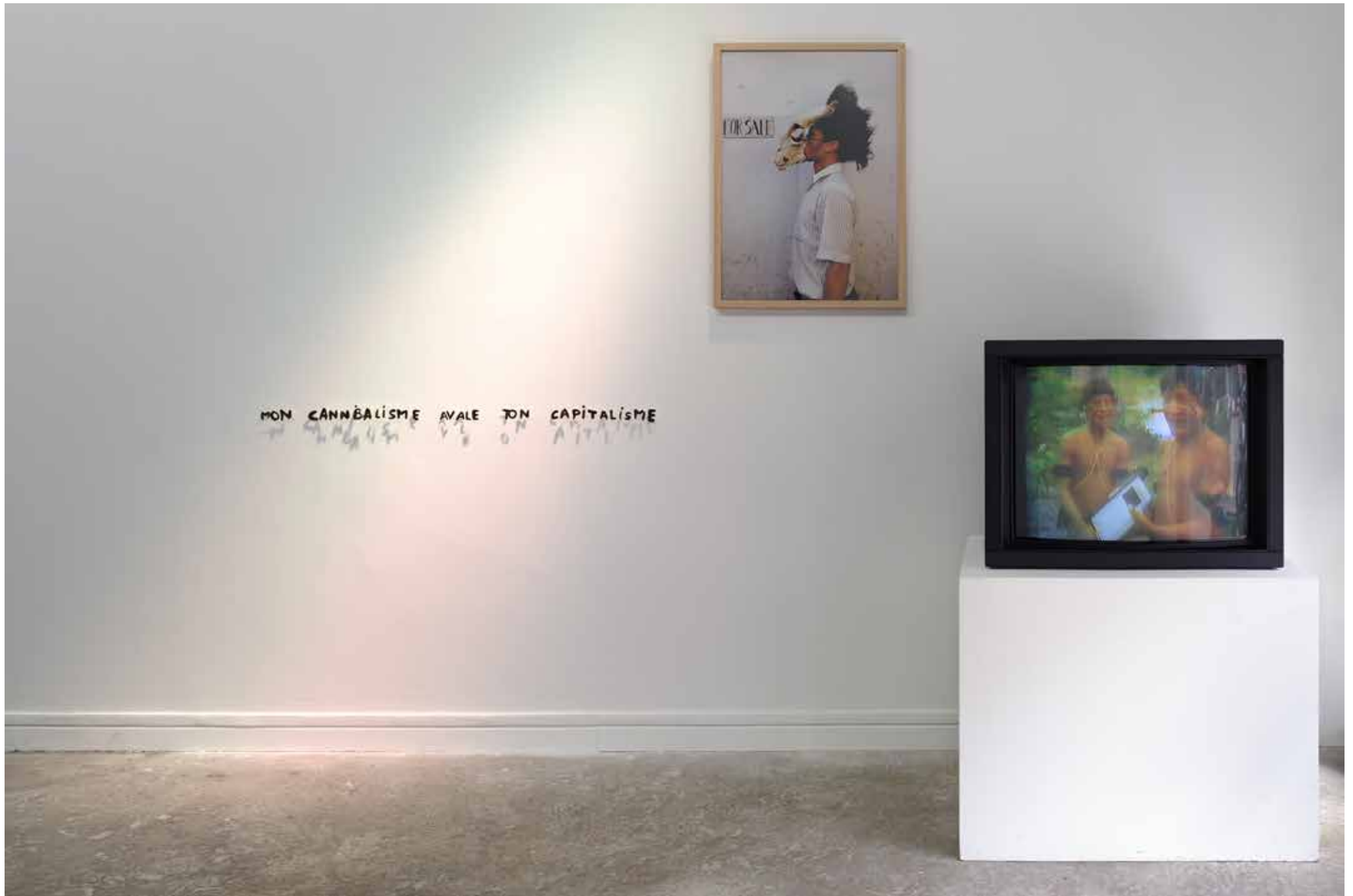
VUE D'EXPOSITION, MY BODY ≠ TA CHOSE EXHIBITION VIEW, MY BODY ≠ TA CHOSE