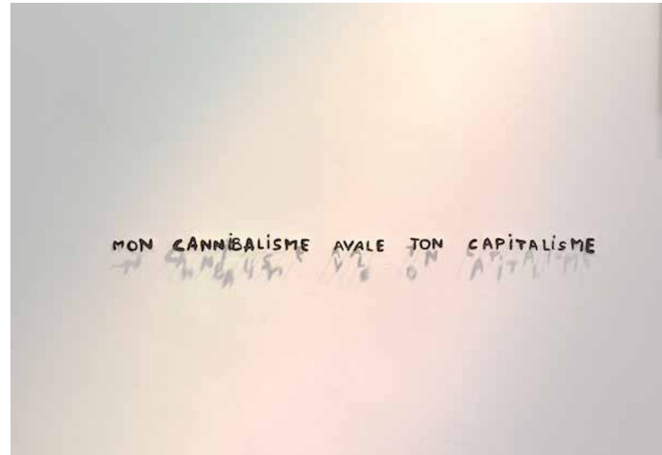
JEAN-FRANÇOIS BOCLÉ, SANS TITRE, ENTOMOLOGIES POÉTIQUES, TECHNIQUE MIXTE, 2019 JEAN-FRANÇOIS BOCLÉ, SANS TITRE, ENTOMOLOGIES POÉTIQUES, MIXED MEDIA, 2019