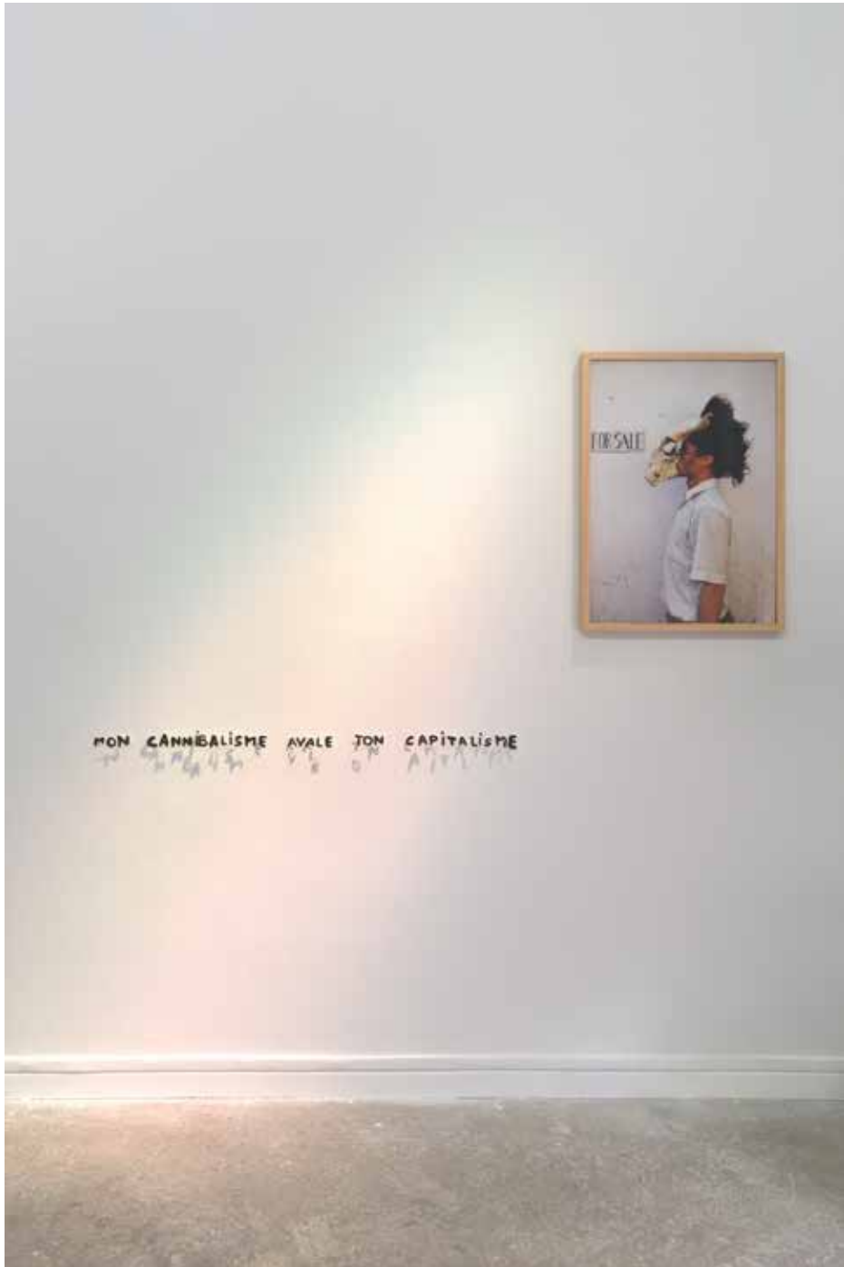
VUE D'EXPOSITION, MY BODY ≠ TA CHOSE EXHIBITION VIEW, MY BODY ≠ TA CHOSE